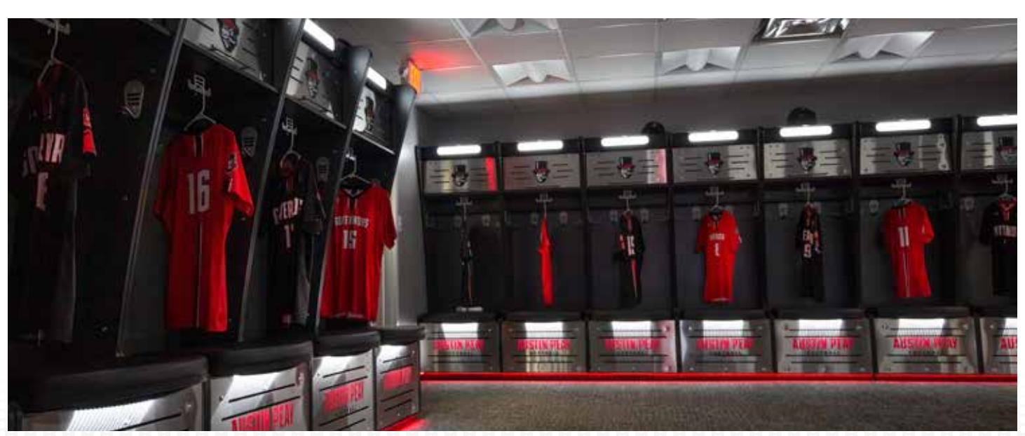
WOMEN'S SOFTBALL LOCKER ROOM, GEARBOSS® ELITE WOOD LOCKERS

"Now we have a space where the athletes can gather to eat, talk, study or just hang out and that's what it's all about. Once you get to know each other better, that chemistry translates onto the field."