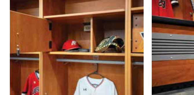
LOCKER CUBBY AND HANGER BAR