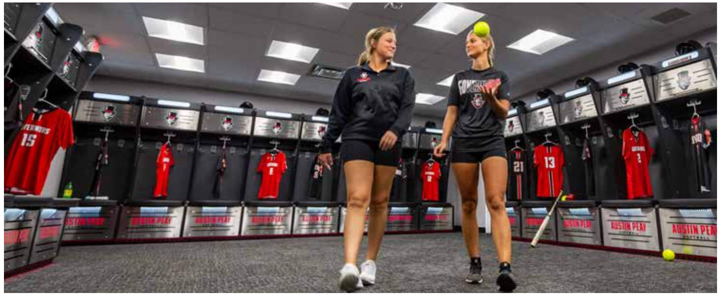
WOMEN'S SOFTBALL LOCKER ROOM, GEARBOSS® ELITE WOOD LOCKERS