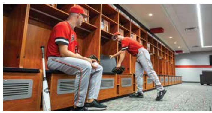
MEN'S BASEBALL LOCKER ROOM